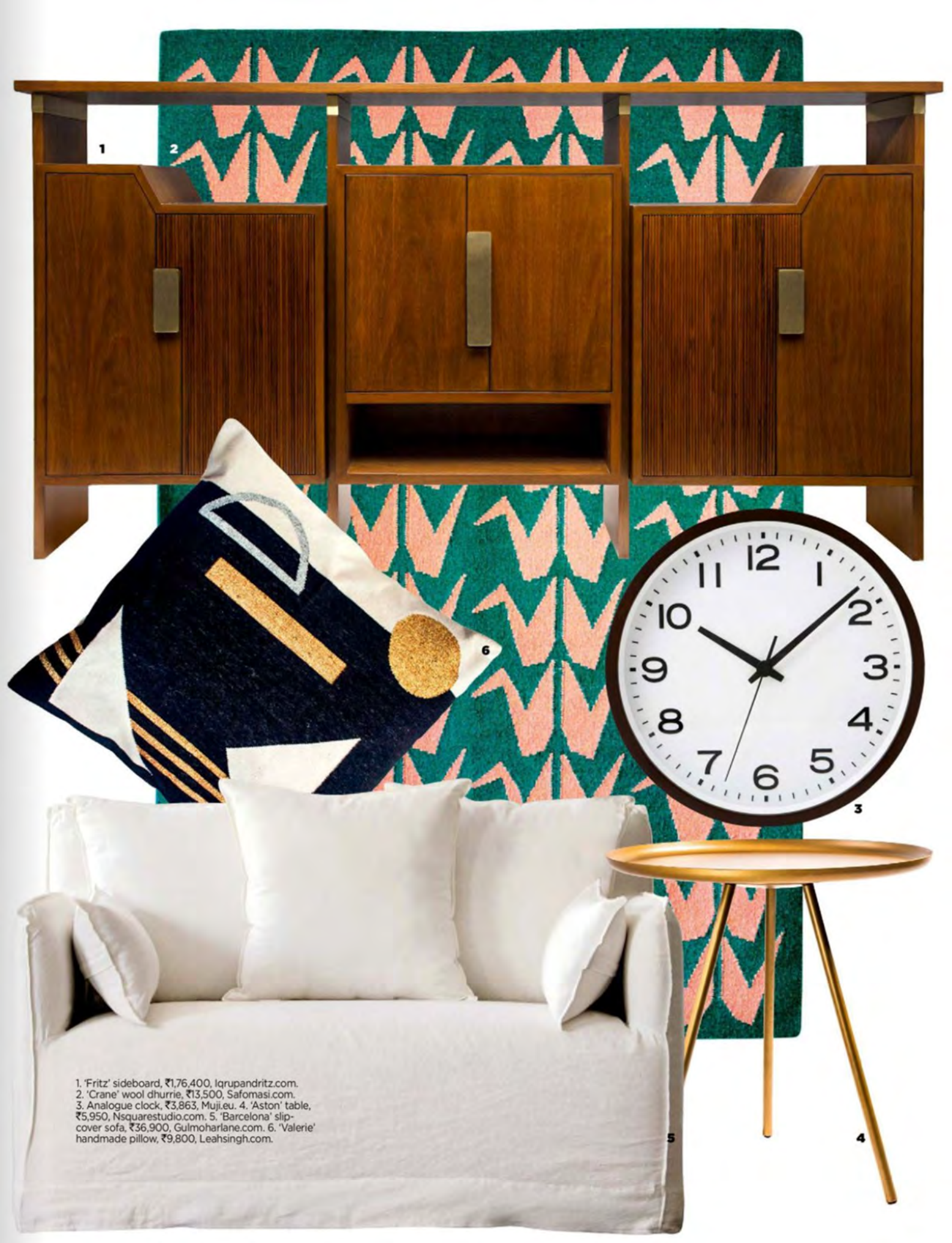
1. 'Fritz' sideboard, ₹1,76,400, Iqrupandritz.com. 2. 'Crane' wool dhurrie, ₹13,500, Safomasi.com. 3. Analogue clock, ₹3,863, Muji.eu. 4. 'Aston' table, ₹5,950, Nsquarestudio.com. 5. 'Barcelona' slip-cover sofa, ₹36,900, Gulmoharlane.com. 6. 'Valerie' handmade pillow, ₹9,800, Leahsingh.com.