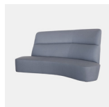
Polar Alcove Sofa