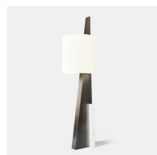
Cut Triangle II