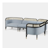
Targa Modular Sofa