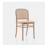
N. 811 Chair