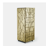
Scrigno Tall Cabinet