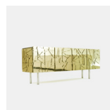
Scrigno Low Cabinet