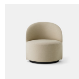
Tearoom Swivel Chair