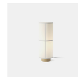
Hashira Table Lamp