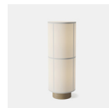
Hashira Floor Lamp