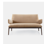
Hug Love Seat