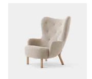
Little Petra VB3