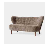
Little Petra VB2