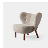
Little Petra VB1