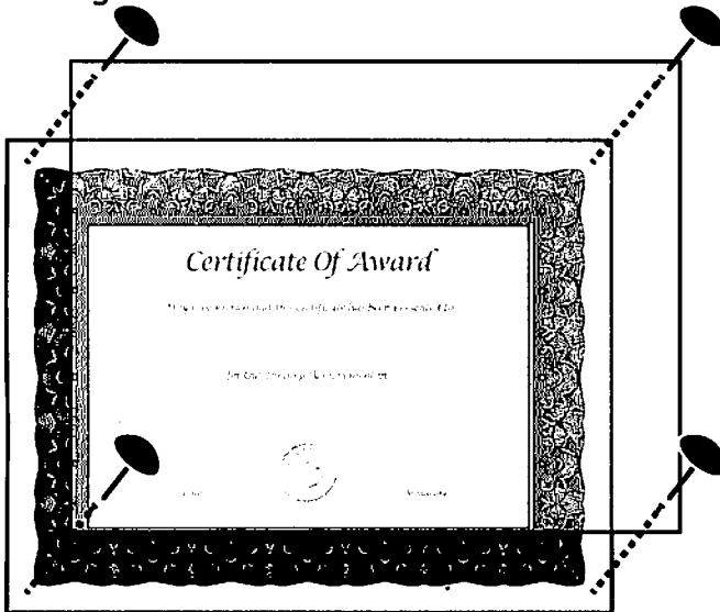
Step 3. Puncture certificate sheet