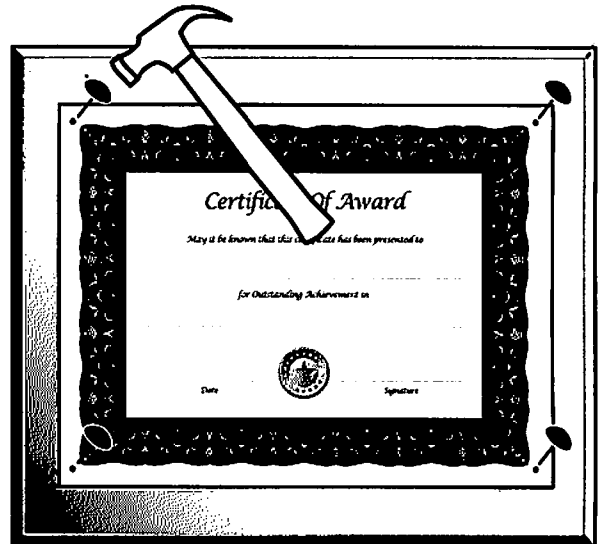
Step 4. Install onto plaque