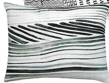
▲ DIFFERENT STROKES This painterly pillow echoes an artist's canvas. Mineral pillow. Approx. $210. Through Kelly Wearstler.