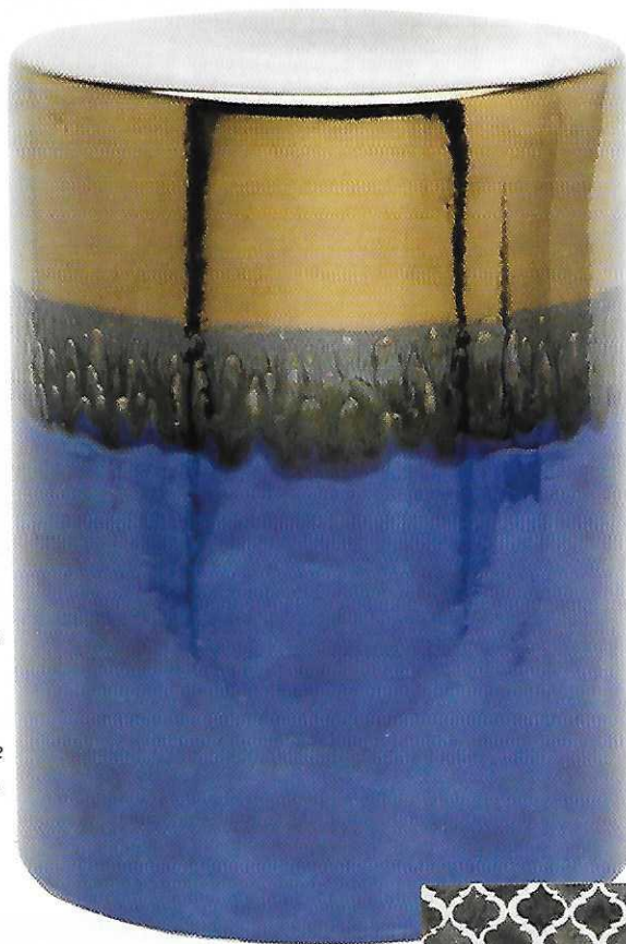
> TRUE BLUE Naturally occurring bubbles and drips give this glazed stool an artisanal feel. Trixie stool/side table. Approx. $560. Through Manor Interior Design and Made Goods.