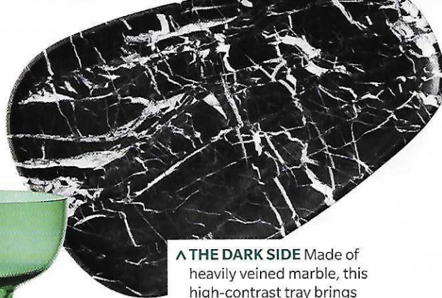
▲ THE DARK SIDE Made of heavily veined marble, this high-contrast tray brings drama to the tabletop. Ingres marble tray by Aerin. $518. At Cocoon Furnishings.