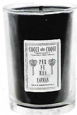
< LET IT GLOW This black beeswax candle smells like a tropical vacation. Vela Aromática scented candle by Coqui Coqui. Approx. $82. Through Net-A-Porter.