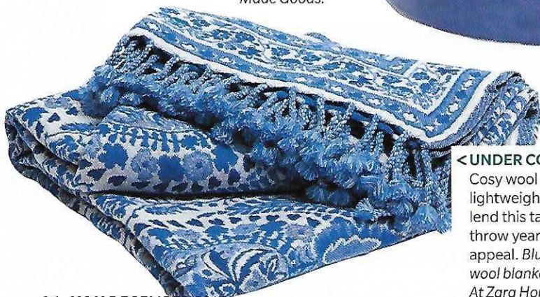
< UNDER COVER Cosy wool and lightweight cotton lend this tasselled throw year-round appeal. Blue Paisley wool blanket. $149. At Zara Home.