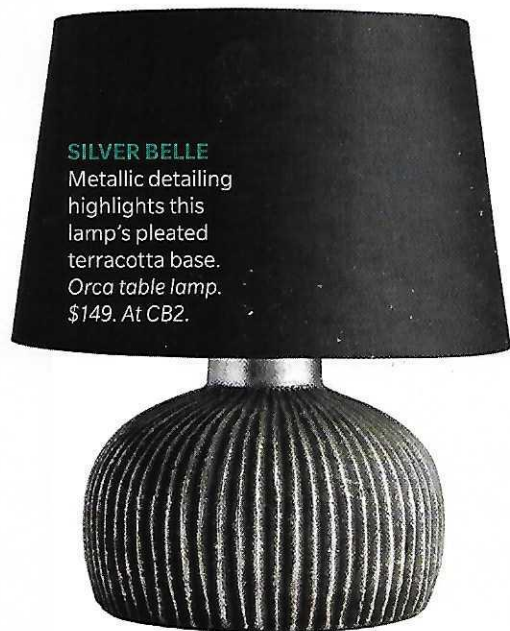
SILVER BELLE Metallic detailing highlights this lamp's pleated terracotta base. Orca table lamp. $149. At CB2.

✓ TAKING TURNS With or without blooms, a curvy glass vase hits all the right notes. Alfredo vase by Alfredo Häberli for Georg Jensen. $248. At Torp.