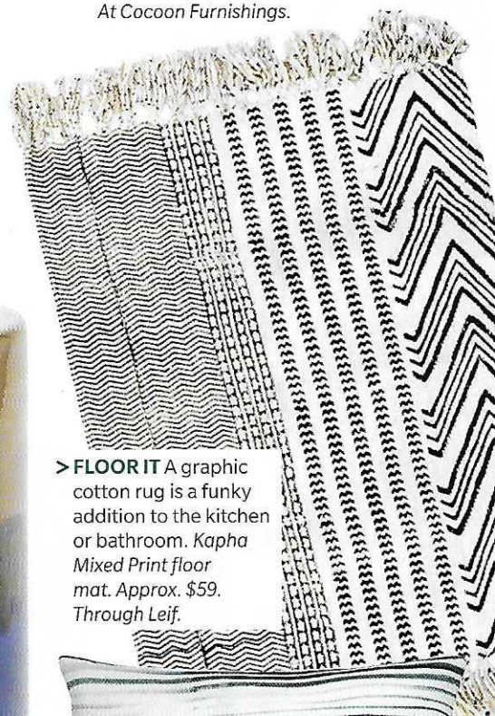
> FLOOR IT A graphic cotton rug is a funky addition to the kitchen or bathroom. Kapha Mixed Print floor mat. Approx. $59. Through Leif.