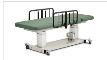
Optional Side Rails & Casters