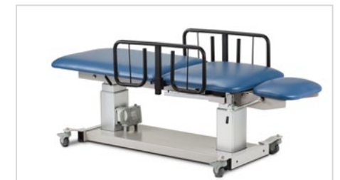
Optional Side Rails & Casters