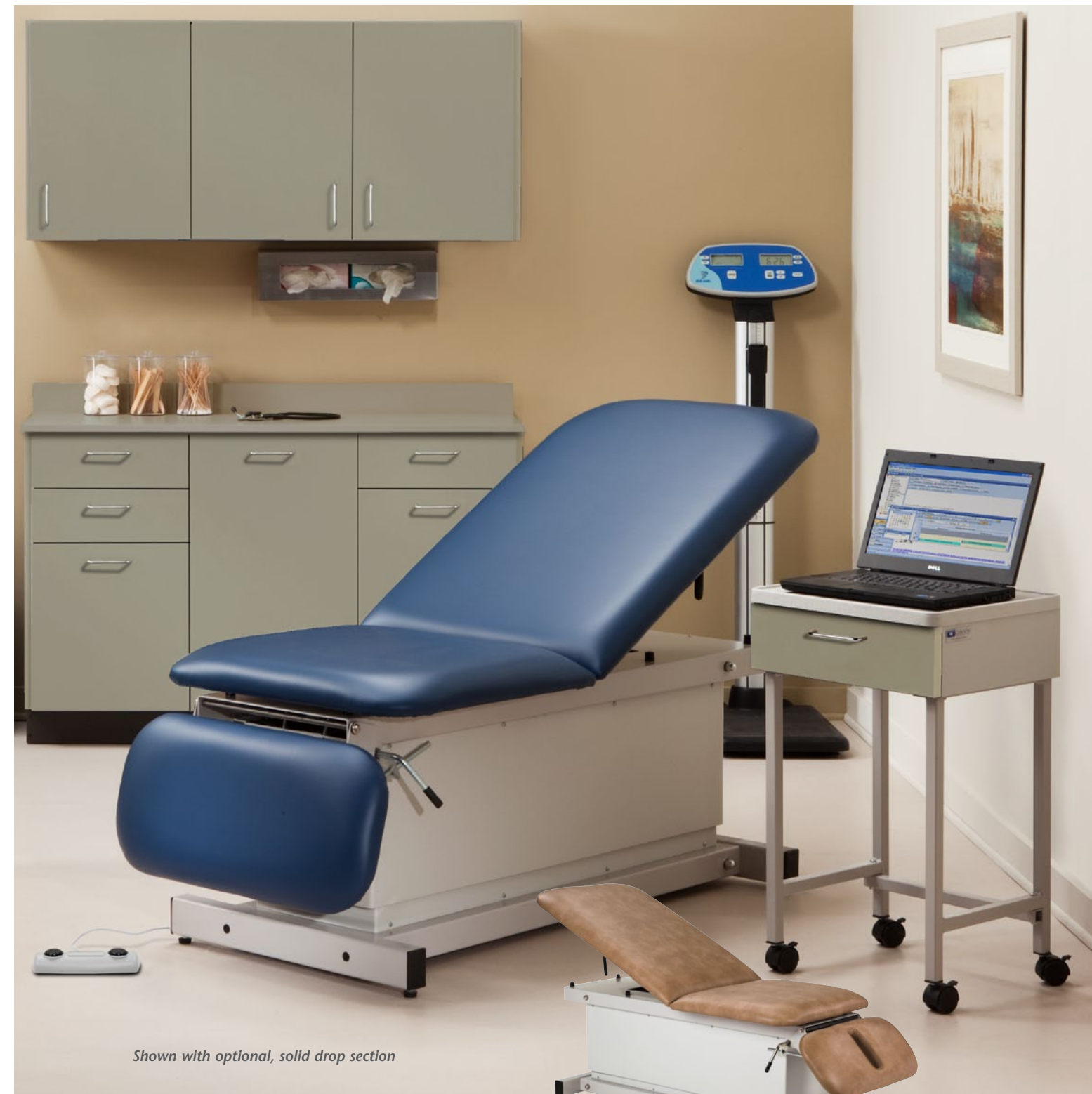
Shown with optional, solid drop section