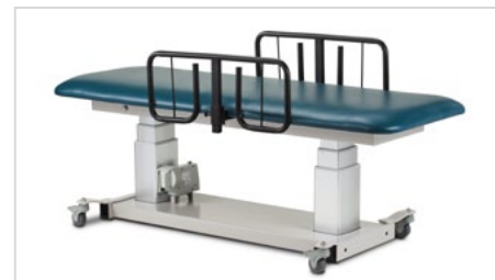
Optional Side Rails & Casters