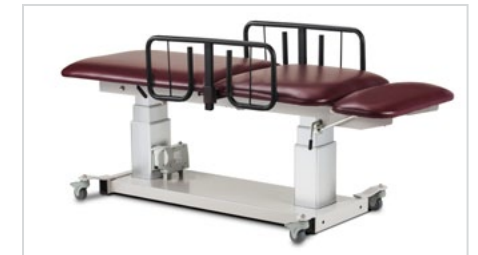
Optional Side Rails & Casters