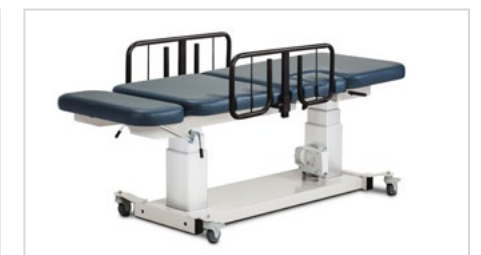
Optional Side Rails & Casters