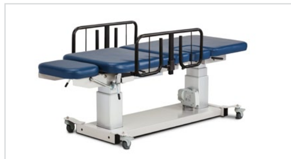
Optional Side Rails & Casters