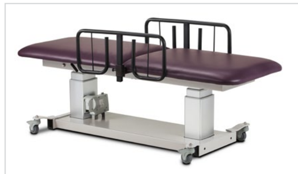
Optional Side Rails & Casters