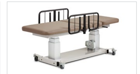
Optional Side Rails & Casters