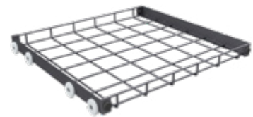
Lower Rack basic