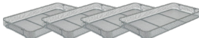
4 X Din Baskets (19" x 10" x 2")