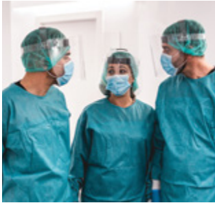
Ambulatory surgery centers

The ultimate automated solution for washing, rinsing, disinfecting, and drying your complex instruments prior to sterilization. Designed to simplify your work by eliminating manual washing and reducing your manpower. Ensuring the safety of your patients by providing consistent quality washing cycles at all time and ensuring the safety of your staff by eliminating risks of exposure to potentially harmful aerosols.