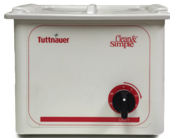
Clean & Simple Ultrasonic Cleaning System PN#CSU1