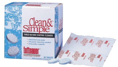
Clean & Simple Ultrasonic Enzymatic Tablets PN#CS0064