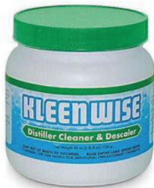
Kleenwise™ Distiller Cleaner and Descaler PN# KSD