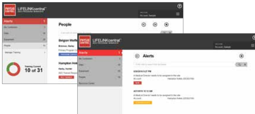
LIFELINKcentral AED Program Manager provides clear, comprehensive information about your AED program.

With LIFELINKcentral AED Program Manager, managing your AEDs has never been easier. Not only will you know for certain that your AEDs are ready when you need them, you'll also save time and money on your AED program management via our streamlined web portal which offers improved functionality and ease of use.