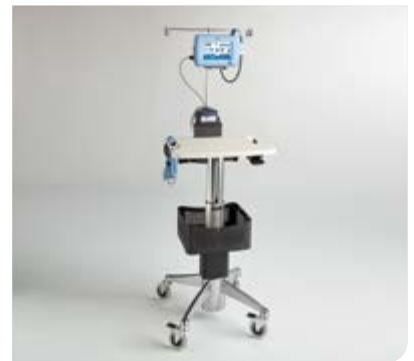
6231 Care Exchange® Workstation