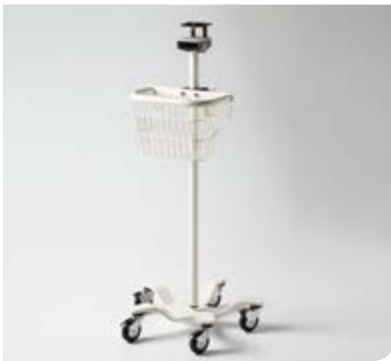
IQvitals® Mobile Cart

Giving you the tools you need to improve quality of care is so important to us. We want you to have everything you need to make the best use of your vitals device.