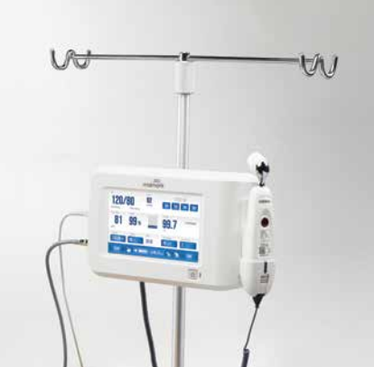
EQUIPMENT POLE MOUNT