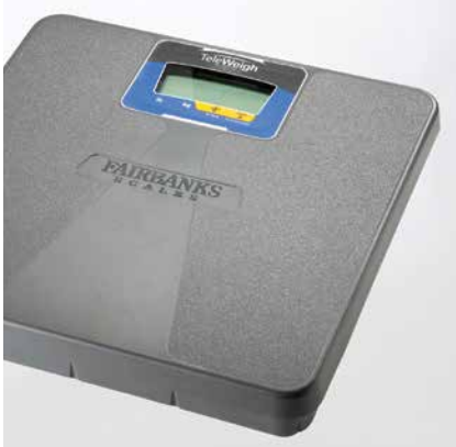
FAIRBANKS® TELEWEIGH™ DIGITAL SCALE