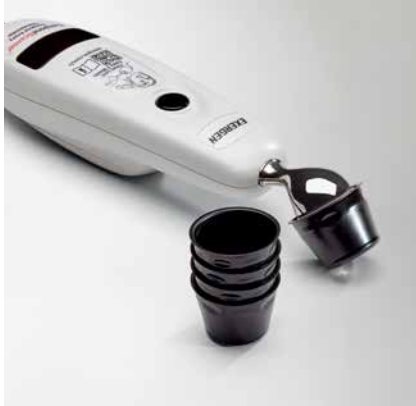
EXERGEN® THERMOMETER DISPOSABLE CAPS