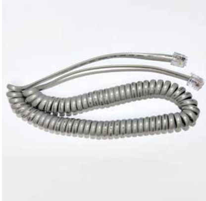
MIDMARK® DIGITAL SCALE SERIAL CABLE (6')