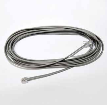
MIDMARK DIGITAL SCALE SERIAL CABLE (15')