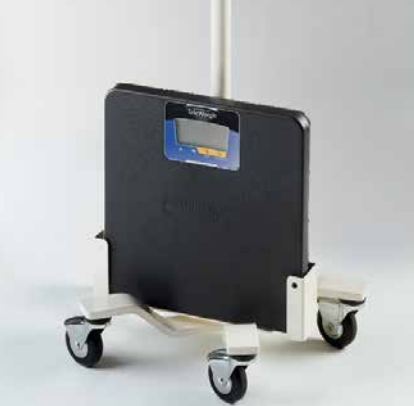
FAIRBANKS® SCALE MOUNT