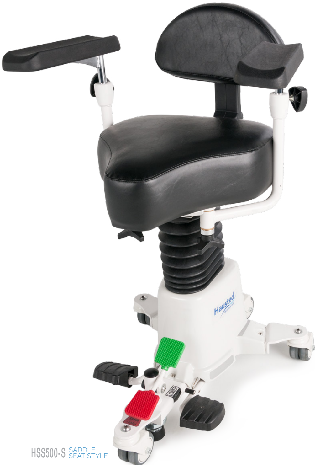
HSS500-S SADDLE SEAT STYLE