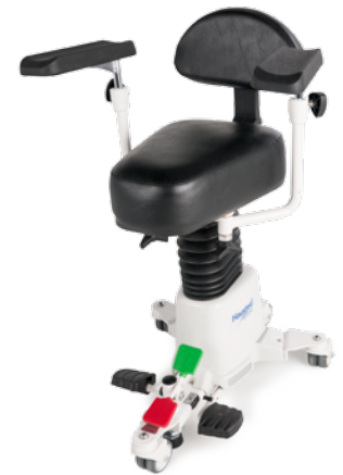
HSS500-W WEDGE SEAT STYLE