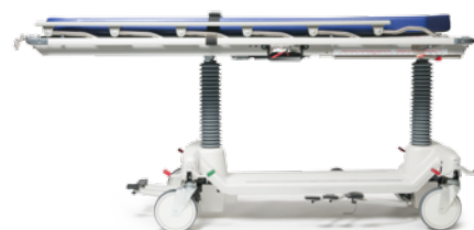
slides 12 inches (30 cm)