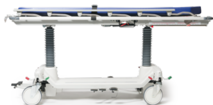
slides 6 inches (19 cm)