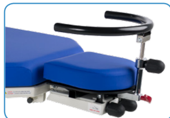
Optional Accessory: Full "U" Wrist Rest Item No: HSA078600