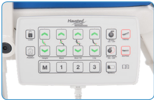
Positioning at Your Fingertips: Intuitive Hand Pendant with Pre-Sets and 3 Memory Positions