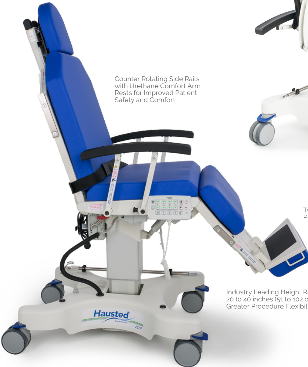
Two-position Foot Rest For Patient Comfort and Safety