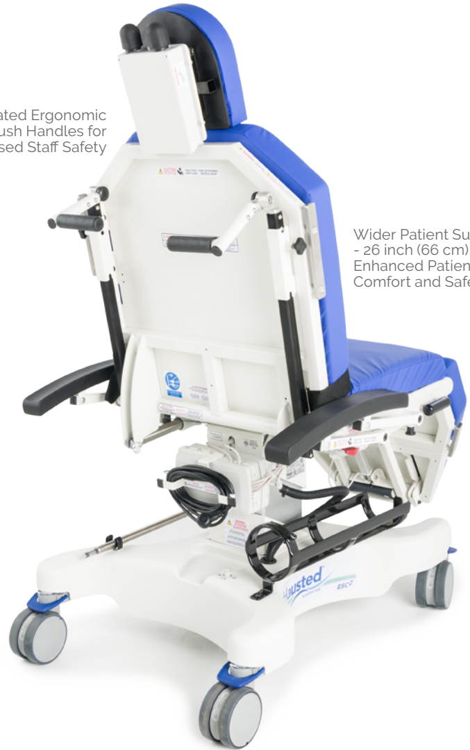
Wider Patient Surface - 26 inch (66 cm) for Enhanced Patient Comfort and Safety