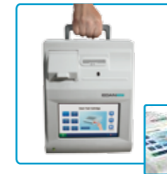
Portable and lightweight