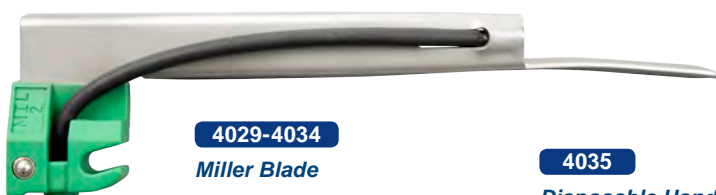
4029-4034 Miller Blade