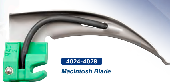
4024-4028 Macintosh Blade