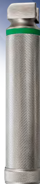
4035 Disposable Handle (4036 not pictured)