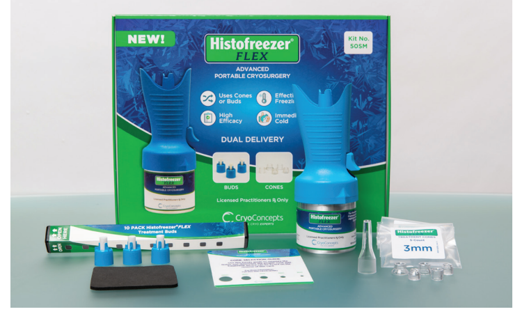
50 Count Mixed Kit (#200-5052)

Contact your MedPro Account Manager TODAY!