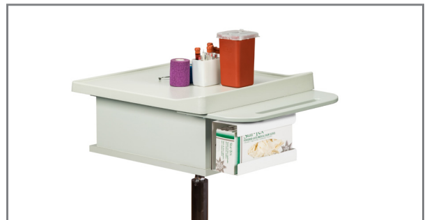
GW-2000 Single White Steel Glove Box Holder