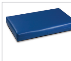
060 Large Pillow