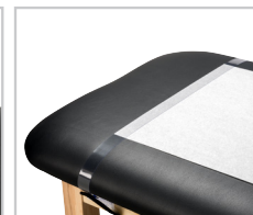
040 Paper Cutter