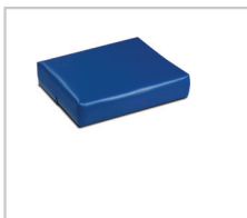
020 Small Pillow