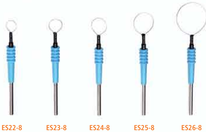
ES22-8 ES23-8 ES24-8 ES25-8 ES26-8