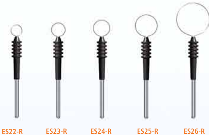
ES22-R ES23-R ES24-R ES25-R ES26-R