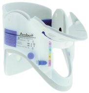
Ambu® Perfit ACE®