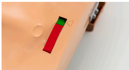
Compression Depth Indicator