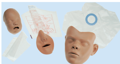
Unique Ambu Hygienic System