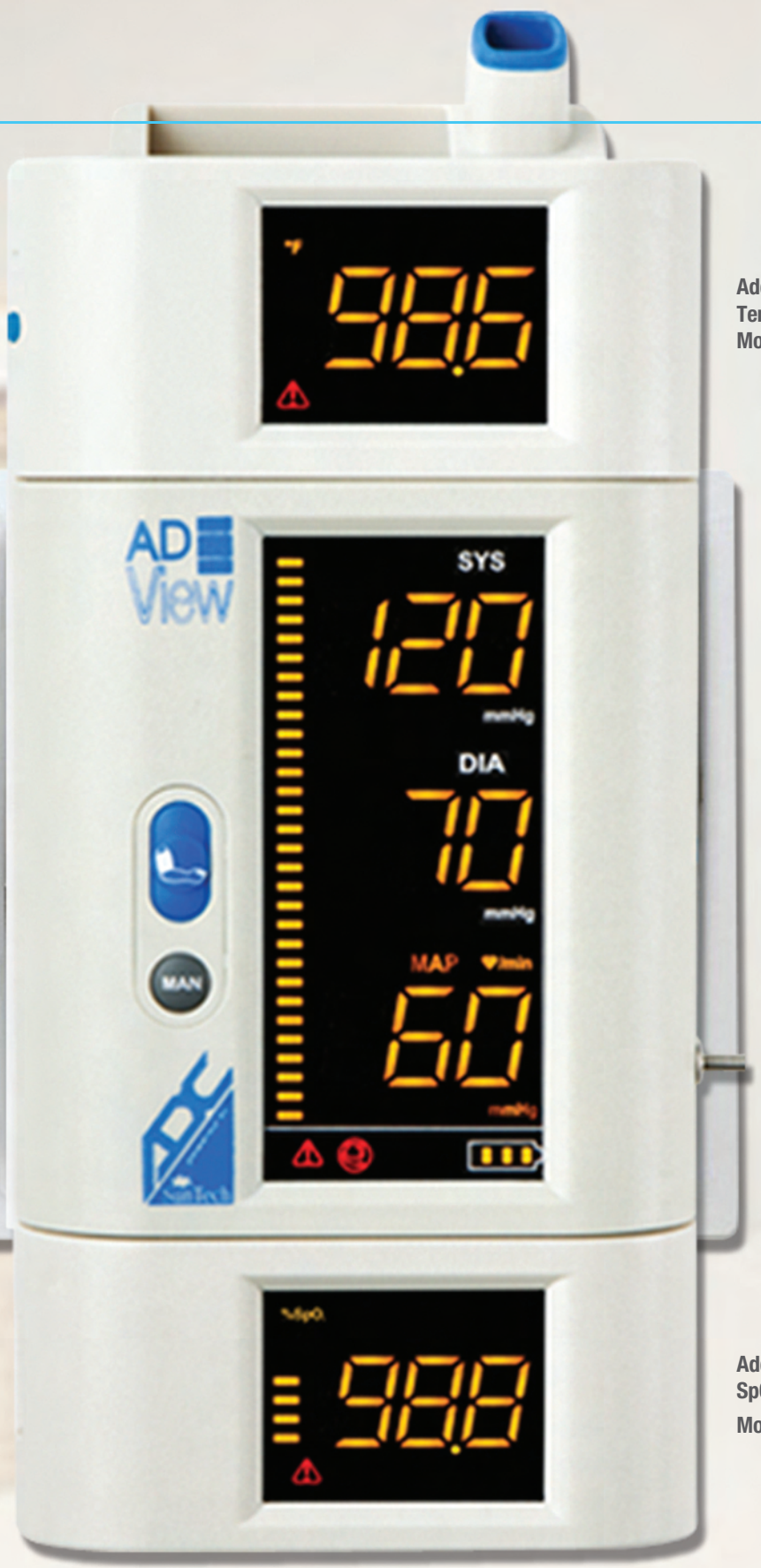
Complete Adview Vital Signs Monitor - BP, Temp, SpO 2