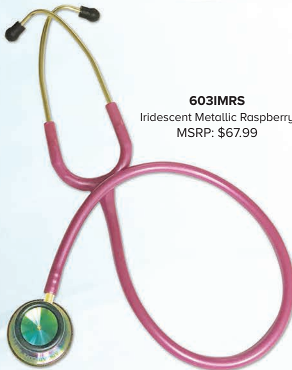
603MRS Iridescent Metallic Raspberry MSRP: $67.99