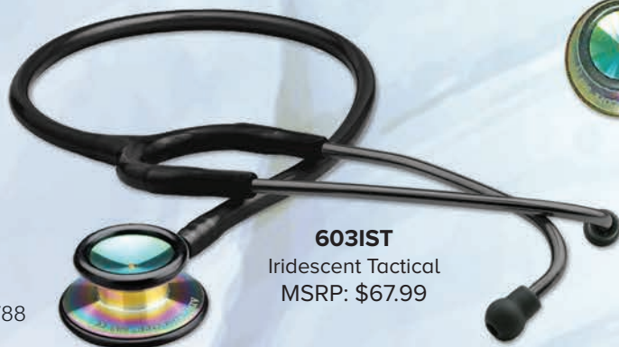
603IST Iridescent Tactical MSRP: $67.99

55 Commerce Drive Hauppauge, New York 11788 Tel: 1-800-ADC-2670 Fax: 631-273-9659 www.adctoday.com