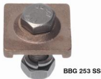
BBG 253 SS

Material: Aluminium with M10 x 35mm Stainless Steel Set Screw.