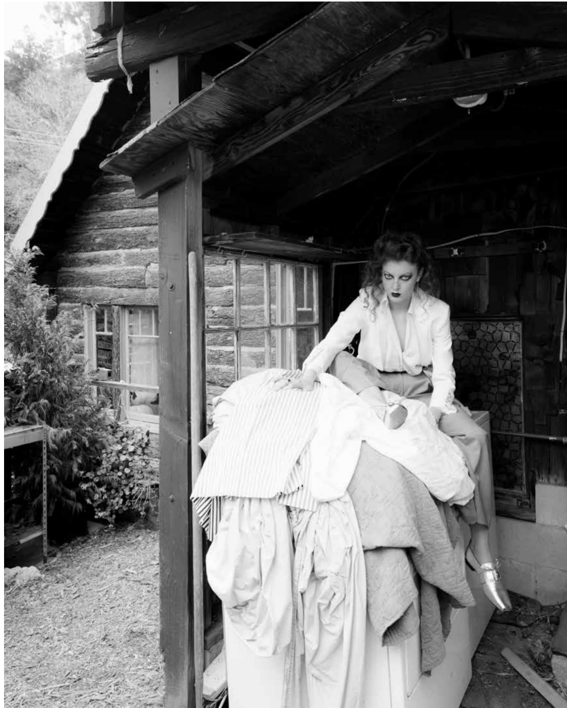
Jacket by BURBERRY Blouse: VINTAGE Pants: VINTAGE MICHAEL KORS Ring by L'ENCHANTEUR Bracelet, Earrings by SOKO Shoes by PIERRE HARDY OPPOSITE: Denim Shirt: VINTAGE CALVIN KLEIN Tiger's Eye Necklace by LEGIER Earrings by SOKO Bracelets, Necklace: STYLIST'S OWN Small Stone Ring by VALOU Large Stone Ring by BLKHEX