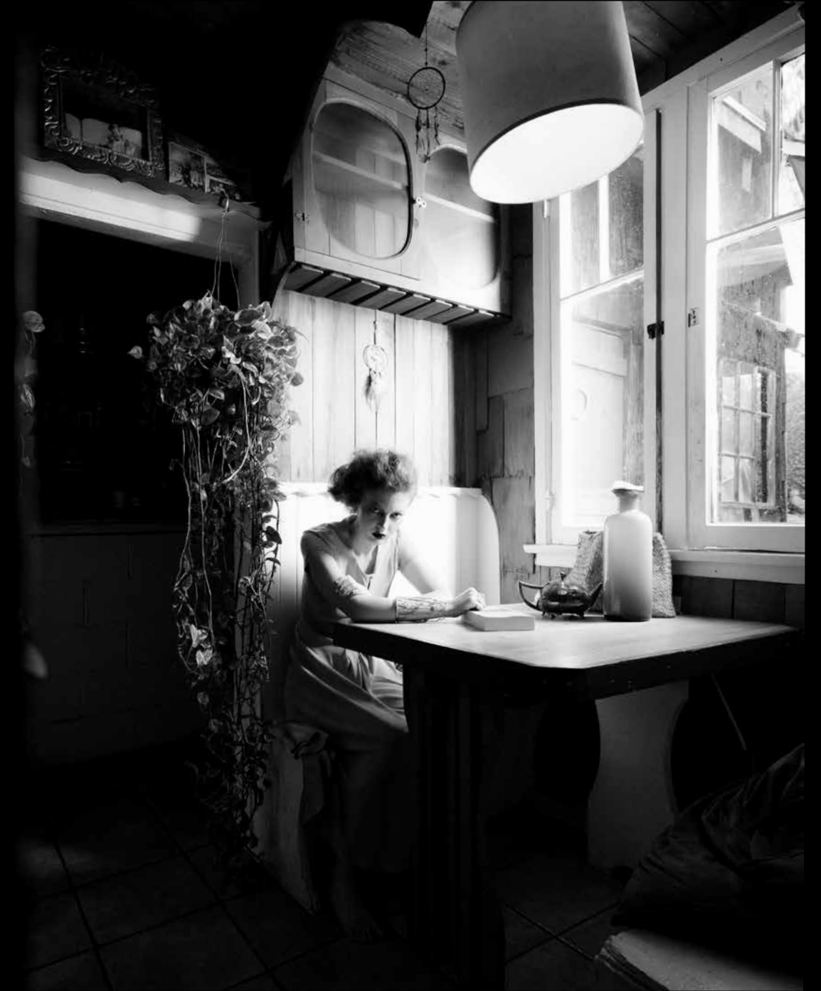
Dress by VIONNET Cuff by L'ENCHANTEUR Ring by VALOU OPPOSITE: Monokini by RUDI GERNREICH Vest by GUCCI Blue Bangle by DSQUARED2 Brass Bangles: STYLIST'S OWN Ceramic Necklace by PETER ST. LAWRENCE Ring by PIRITA