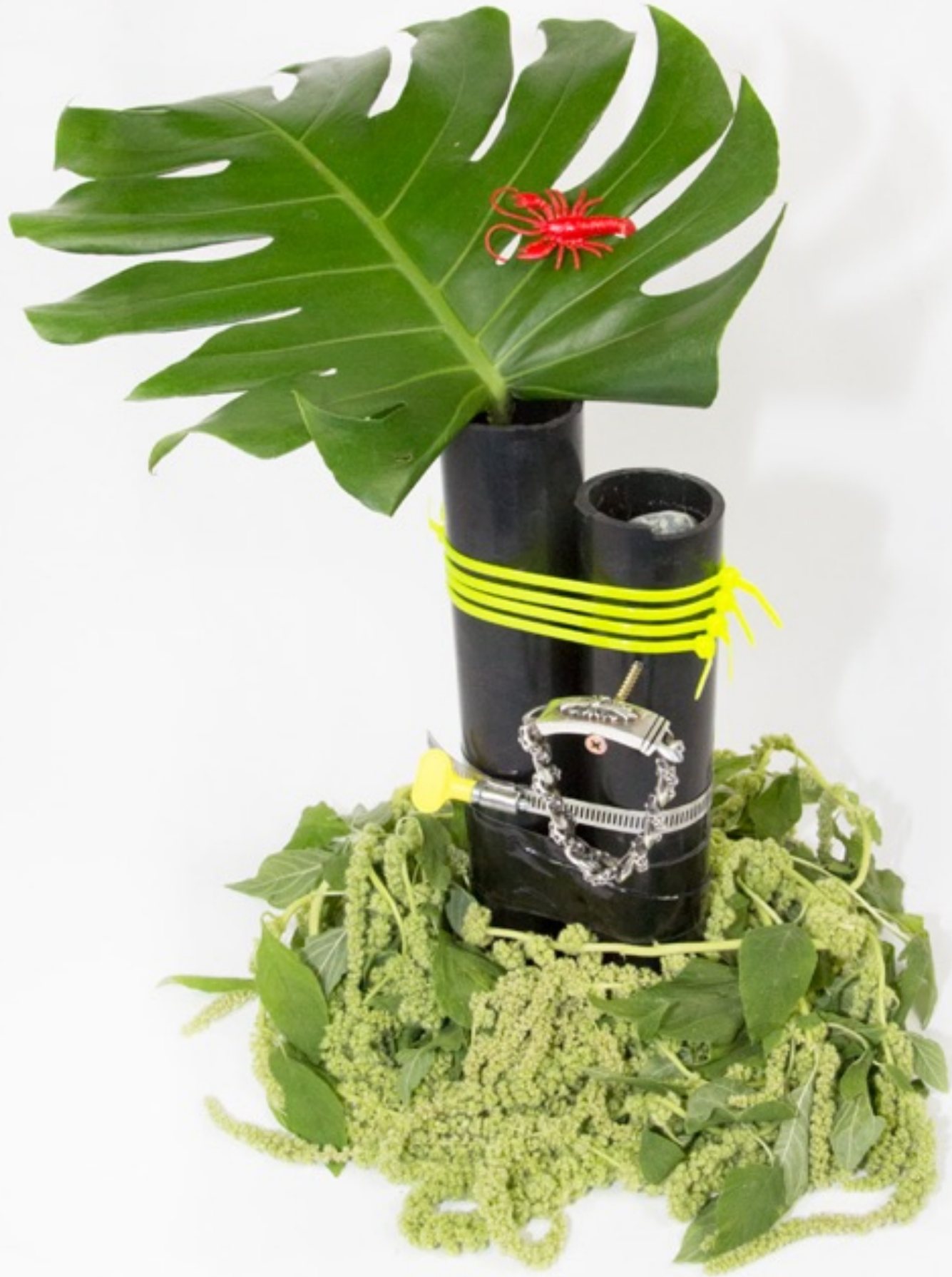
Fancy Chain Id Bracelet Chrome Hearts