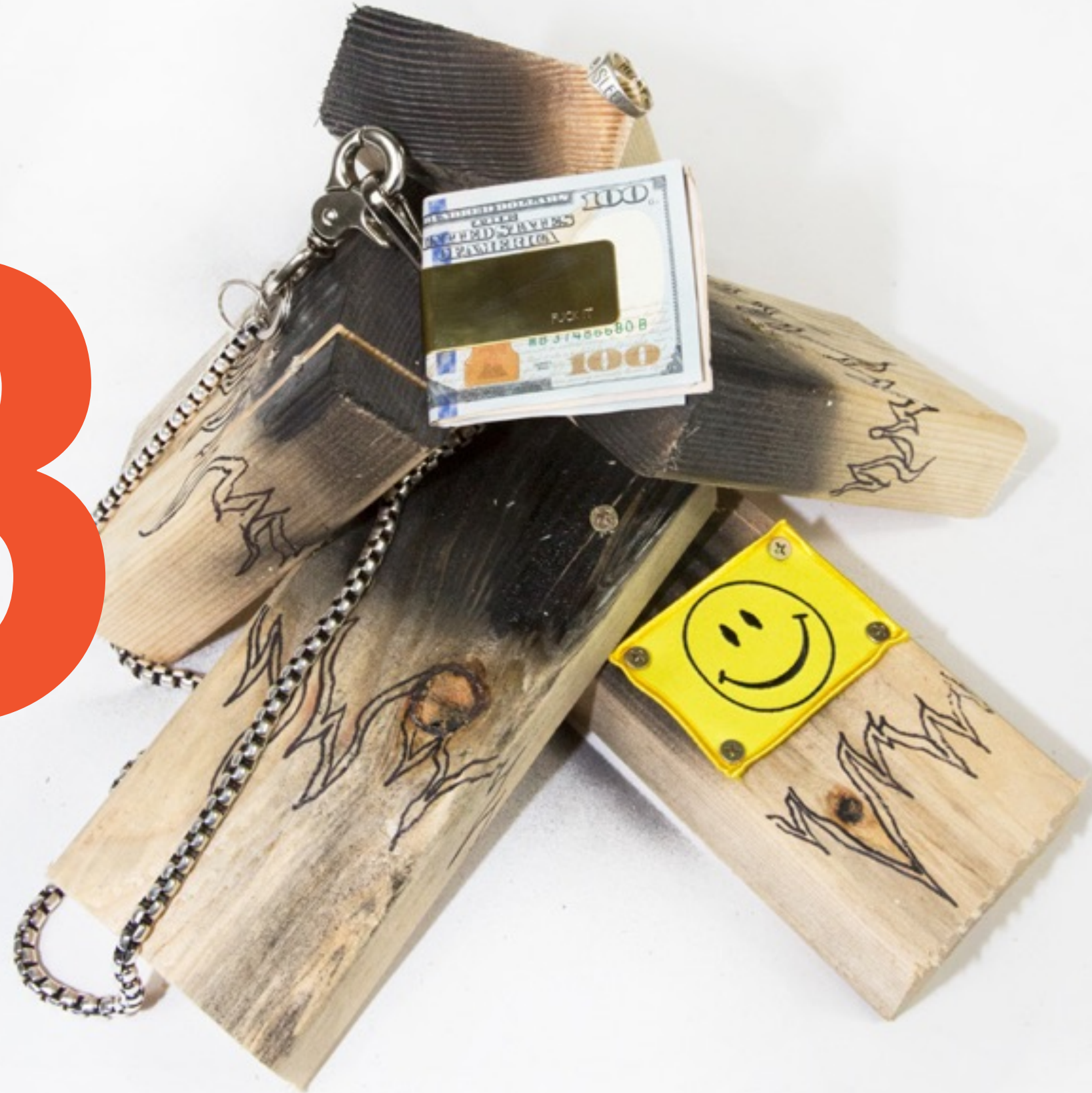
Boxer Chain Martine Ali , "Never Sleep" Ring Nikolai Rose , "Fuck It" Money Clip In God We Trust