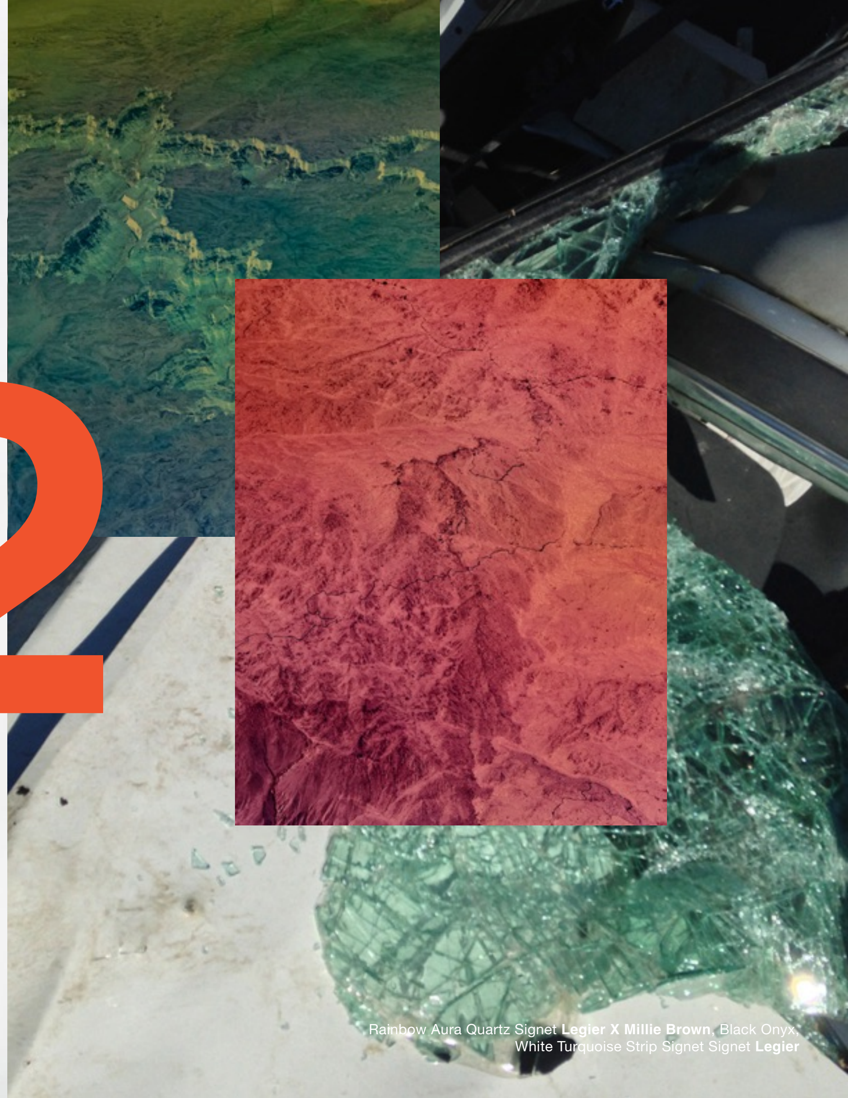
Rainbow Aura Quartz Signet Legier X Millie Brown, Black Onyx, White Turquoise Strip Signet Signet Legier