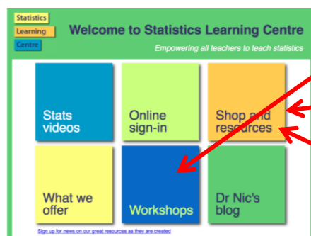
StatsLC Workshop 2016 8/6/16

Go to www.StatsLC.com and click on "Workshops". This also gives access to our free and paid resources through our shop.