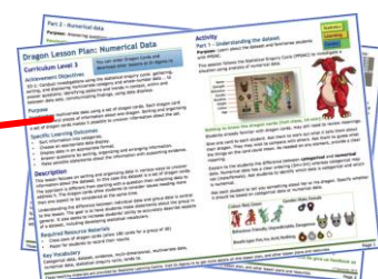
Free lesson plans