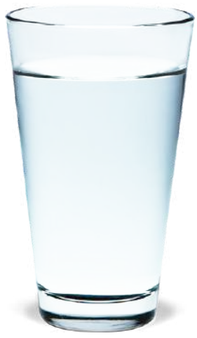
Glass of water