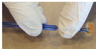
Separating head of device from handle