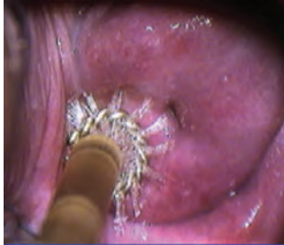
SpiraBrush CX ® being applied, pressed and rotated gently.