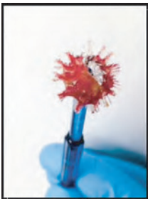
Brush head with tissue trapped between bristles