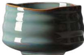
A12-10097 V08 - tiruburu