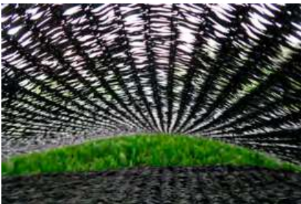
25 days before harvest 70% shaded

Tencha tea fields are covered by the black mesh netting on the top and sides during the harvest season. This is the unique cultivation process which makes Matcha more nutritious than any other teas. One month before harvest Tencha tea leaves are covered by the black mesh netting to gradually block sunlight from the leaves. Shading the tea plants makes the leaves thinner, softer, and a more vivid deep green color as a result, produces more chlorophyll and amino acids. Then only the baby leaves are harvested to produce the highest quality matcha.