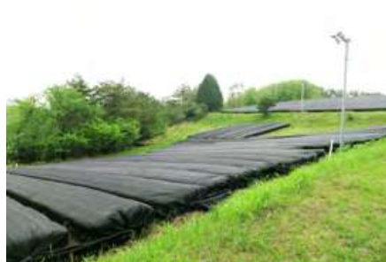
15 days before harvest 95% shaded