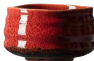
A12-10102 V13 - shinku