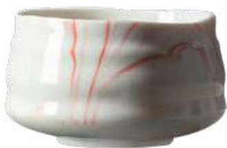
A12-10093 V04 - momoiro