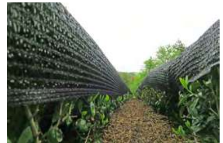
By mid-April, the top and the side of the tea fields are entirely covered by black fabric nettings.