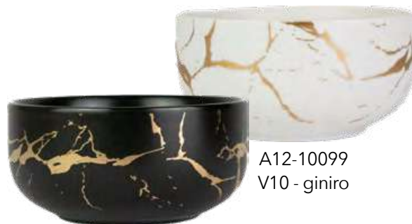
A12-10099 V10 - giniro