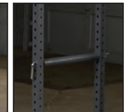
Pipe & Pin safeties PPRPS