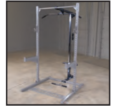
Lat Attachment PLA500