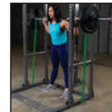
Band Pegs PPRBP