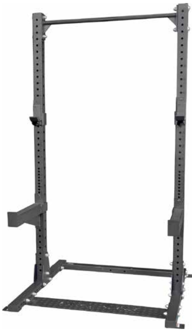
COMMERCIAL HALF RACK SPR500