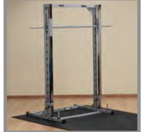
PSM144X Smith Machine