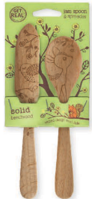
Jam Spoon & Spreader Set

#1860 7.5" x 2.5" x .75" in blister packaging stainless steel with decal