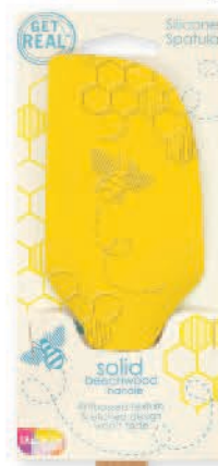
#2900 Large - 12" long 13" x 3" x .5" in packaging