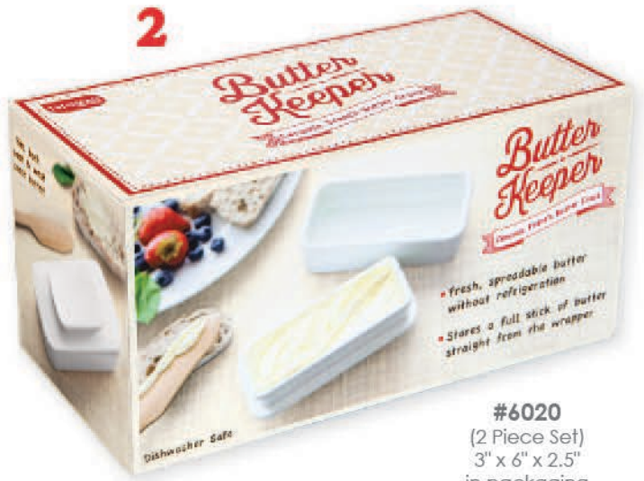
#6020 (2 Piece Set) 3" x 6" x 2.5" in packaging