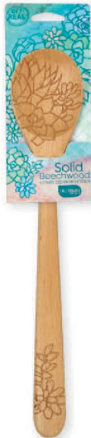
#1996 Sauce 16" x 3" x .5" in packaging