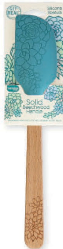
#1900T Teal 13" x 3" x .5" in packaging