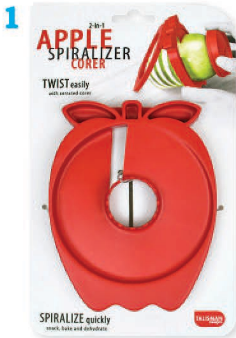
#3130 8.25" x 5.25" x 1.5" in packaging