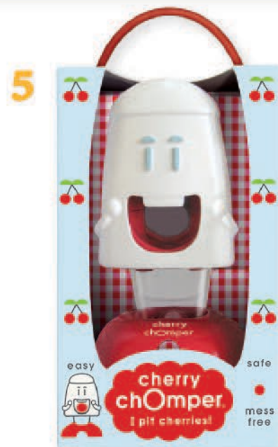
#1286 7.5" x 4.25" x 3" in packaging