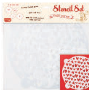
6. Item #1574 (Hearts)