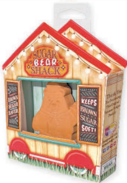
#3630 (1 Piece) 5.5" x 4.75" x 1" in packaging