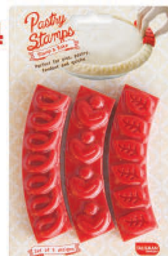
#1540 (3 Piece Set) 7" x 4.5" x .5" in packaging