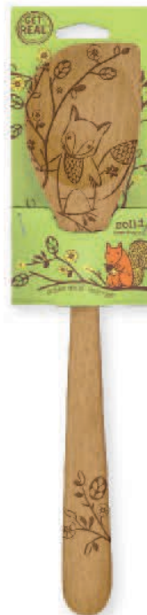
#1824 Corner 14" x 3" x .5" in packaging