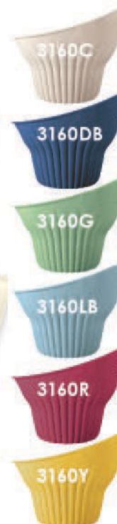
Color Options Available