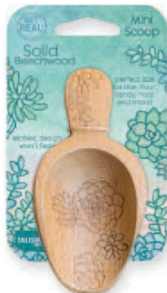
#1976 5.5" x 3" x .75" in packaging

Perfect for nuts, sugar & on charcuterie boards.