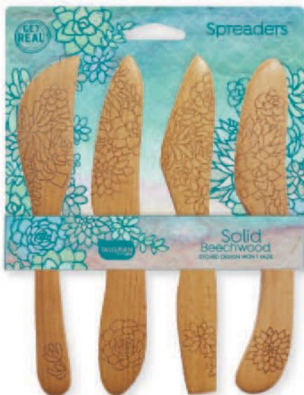
#2307 (4 Piece Set) 7" x 6" x .5" in packaging