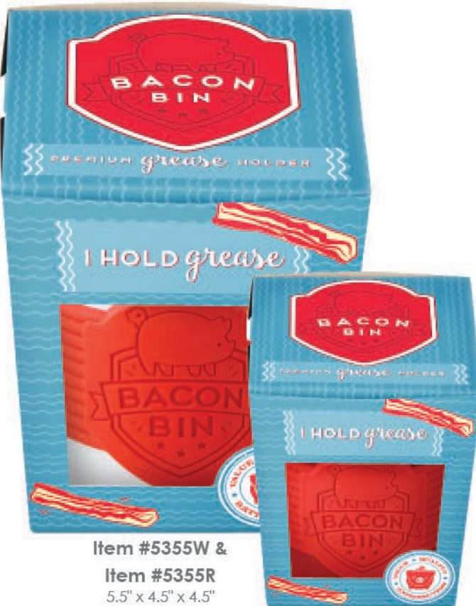
Item #5355W & Item #5355R 5.5" x 4.5" x 4.5" in packaging