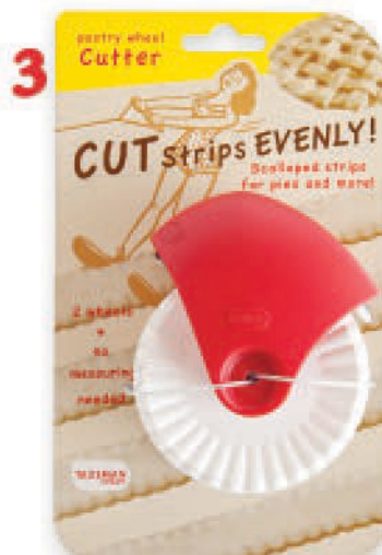
#1530 7" x 4.25" x 1.5" in packaging