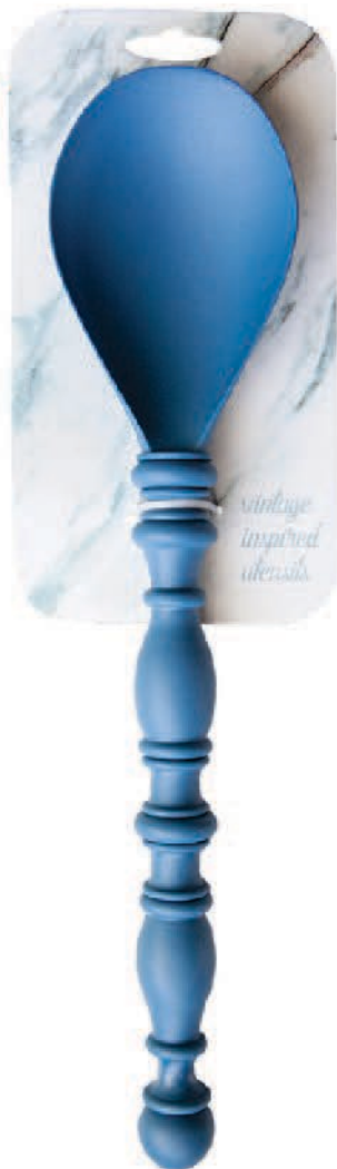
#2202 Mixing Spoon 13" x 3.5" x 1" in packaging