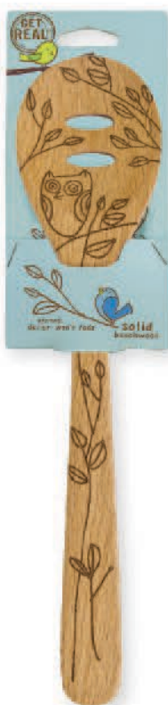
#2115 Slotted 14" x 3" x .5" in packaging