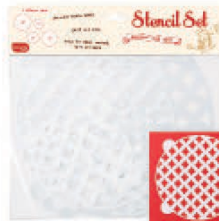
7. Item #1575 (Diamonds)