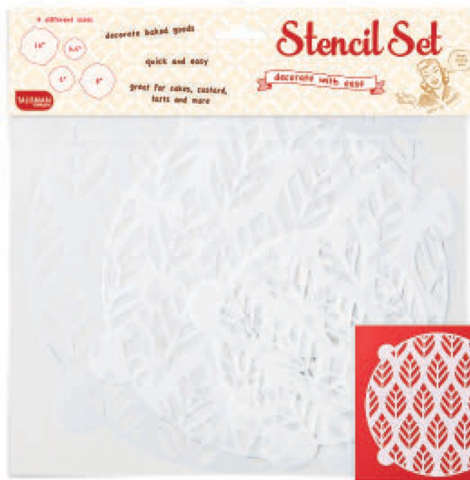
Item #1572 (Autumn) 11" x 10.5" in packaging