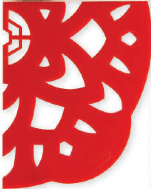
#1560 (Mandala) 9" x 4.5" x .25" in packaging