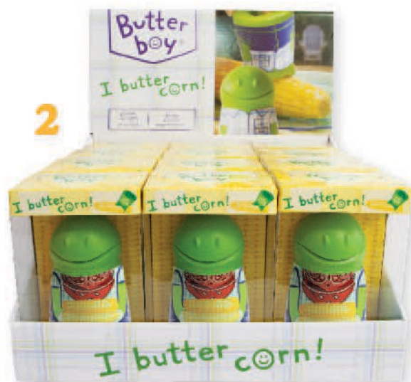
CDU #1270 (QTY: 12 Pieces) 11.75" x 11.75" x 12"