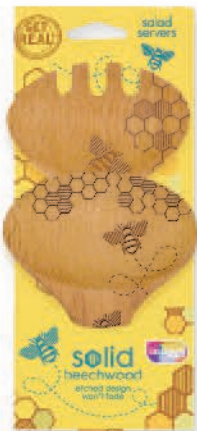
#2966 2 Piece Salad Set 15" x 3.25" x 1" in packaging