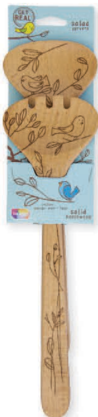
#2160 2 Piece Salad Set 15" x 3.25" x 1" in packaging