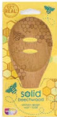
#2915 Slotted 14" x 3" x .5" in packaging