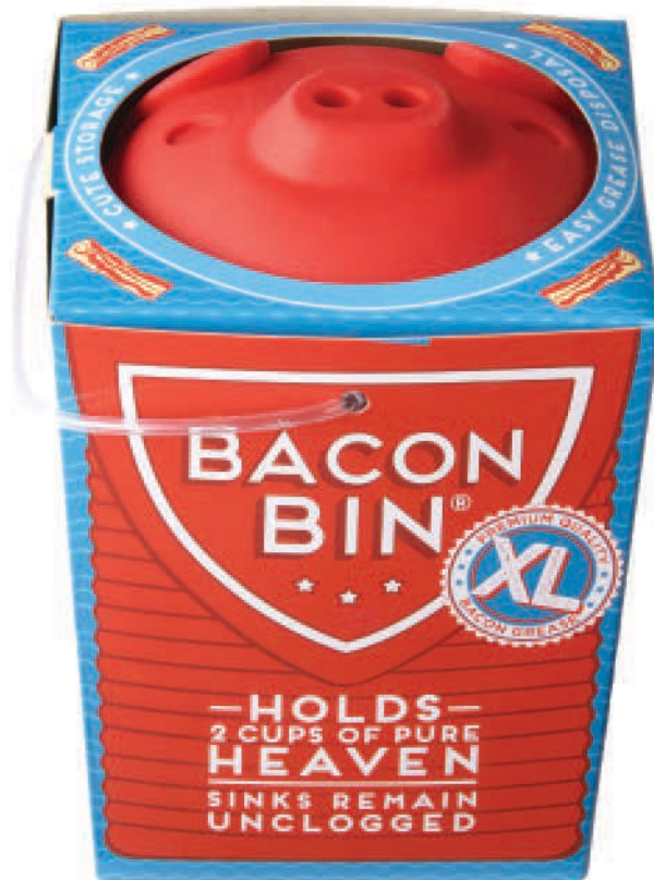
#5350 5.5" x 4.5" x 4.5" in packaging