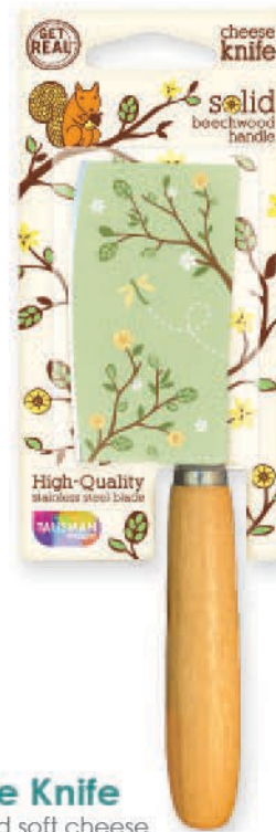
Cheese Knife Cuts hard and soft cheese

#1860 7.5" x 2.5" x .75" in blister packaging stainless steel with decal