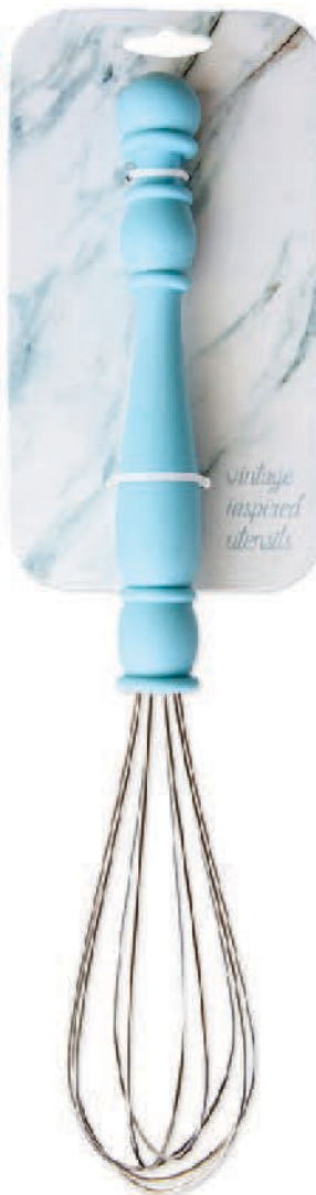
#2206 Balloon Whisk 13" x 3.5" x 2" in packaging