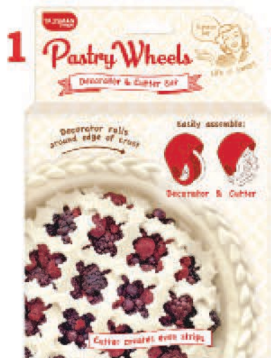
#1523 (5 Piece Set) 7.25" x 5" x 2.25" in packaging