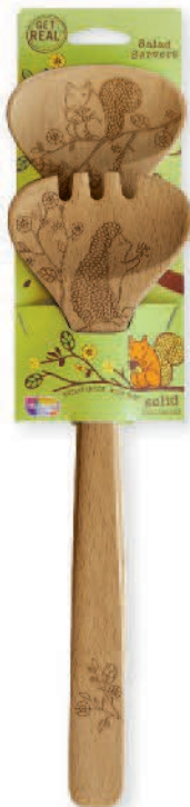
#1863 2 Piece Salad Set 15" x 3.25" x 1" in packaging