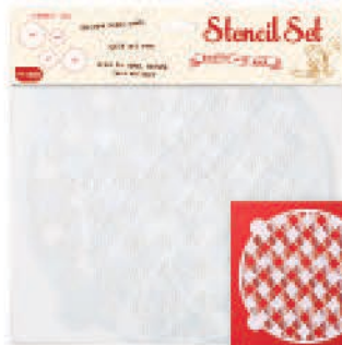
4. Item #1571 (Plaid)