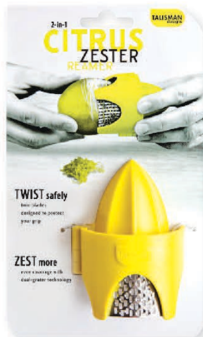
#3115 7" x 4.25" x 2" in packaging