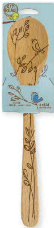
#2108 Mixing 14" x 3" x .5" in packaging