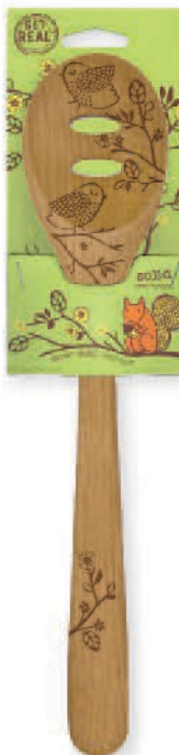
#1812 Slotted 14" x 3" x .5" in packaging