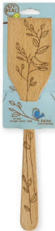
#2139 Turner 14" x 3" x .25" in packaging