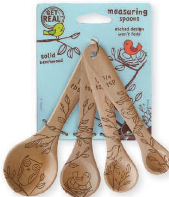
#1203 (4 Piece Set) 7" x 5.5" x 1" in packaging