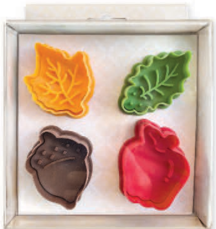
#1582 (Fall) (4 Piece Set)