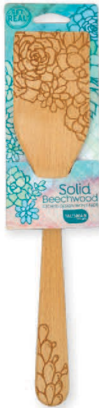
#1934 Turner 14" x 3" x .25" in packaging