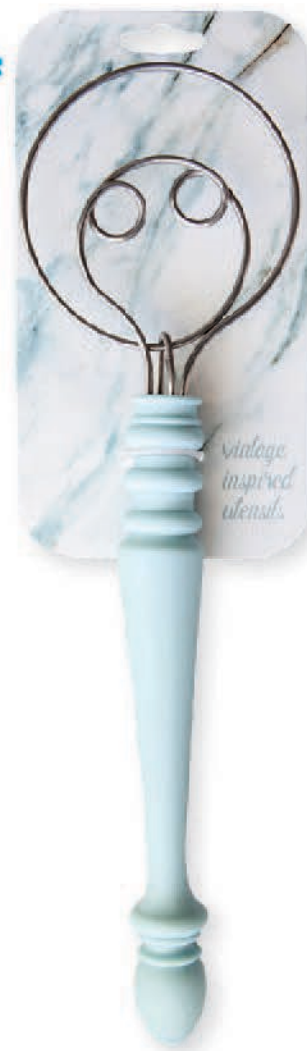
#2208 Dough Whisk 13" x 3.5" x 1" in packaging