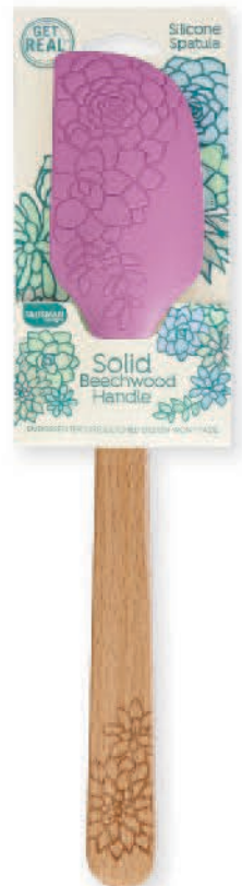
#1900P Purple 13" x 3" x .5" in packaging