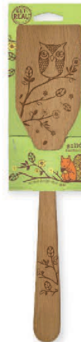
#1836 Turner 14" x 3" x .25" in packaging