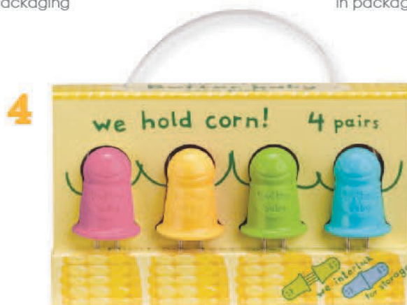
#0920 (4 Sets) 3.5" x 6" x 1.75" in packaging