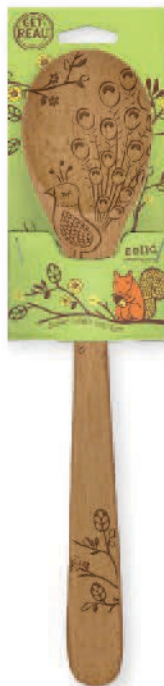
#1805 Mixing 14" x 3" x .5" in packaging