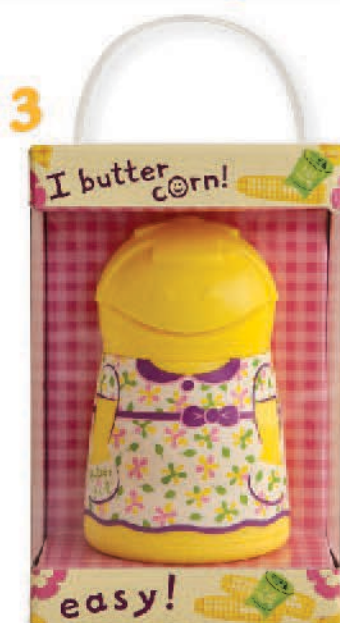
#BGY 5.75" x 3.75" x 2.75" in packaging