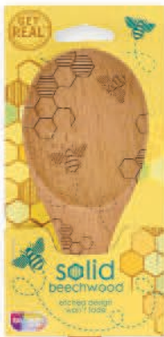
#2902 Mixing 14" x 3" x .5" in packaging