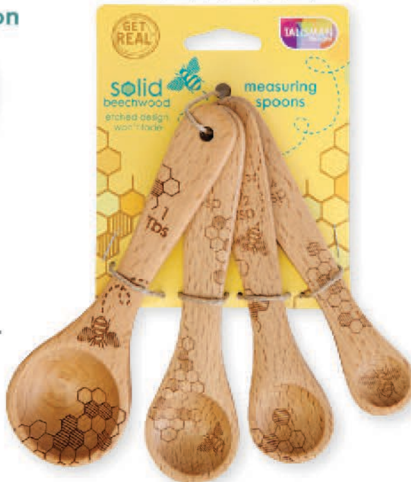
#1225 (4 Piece Set) 7" x 5.5" x 1" in packaging