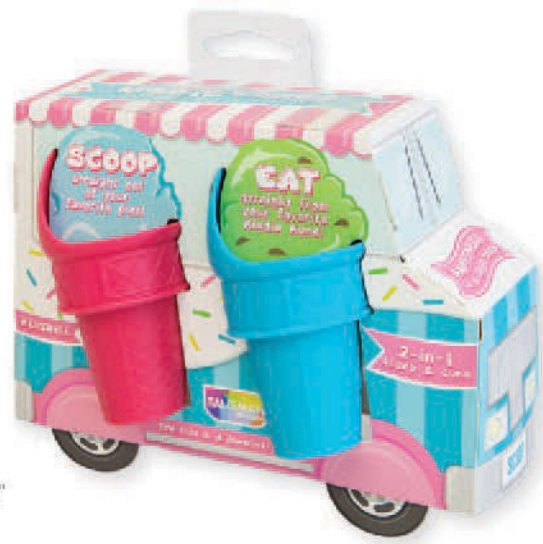
#3650 (4 Piece Set) Small Kones 6" x 1.75" x 4.25" in packaging