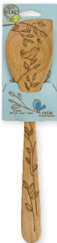
#2122 Corner 14" x 3" x .5" in packaging