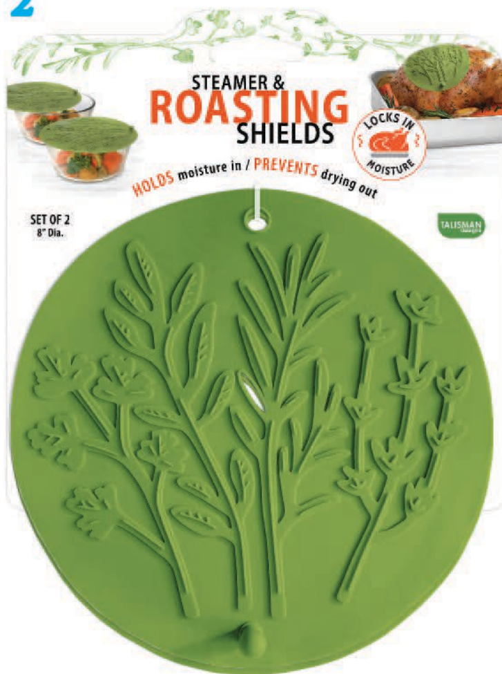
#3170 11" x 8" x .5" in packaging