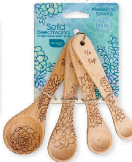
#1222 (4 Piece Set) 7" x 5.5" x 1" in packaging