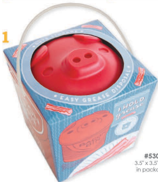
#5300 3.5" x 3.5" x 3.5" in packaging