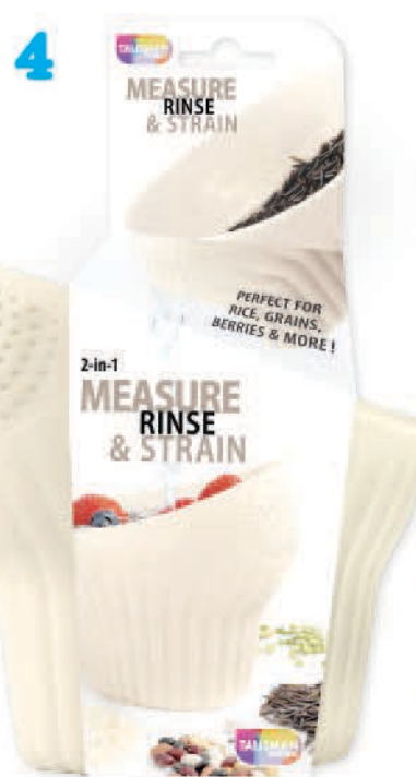
#3160 8.5" x 6.5" x 3" in packaging