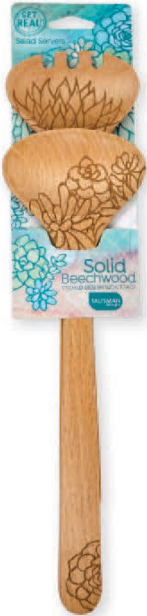
#1967 2 Piece Salad Set 15" x 3.25" x 1" in packaging