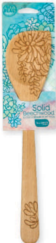
#1923 Corner 14" x 3" x .5" in packaging