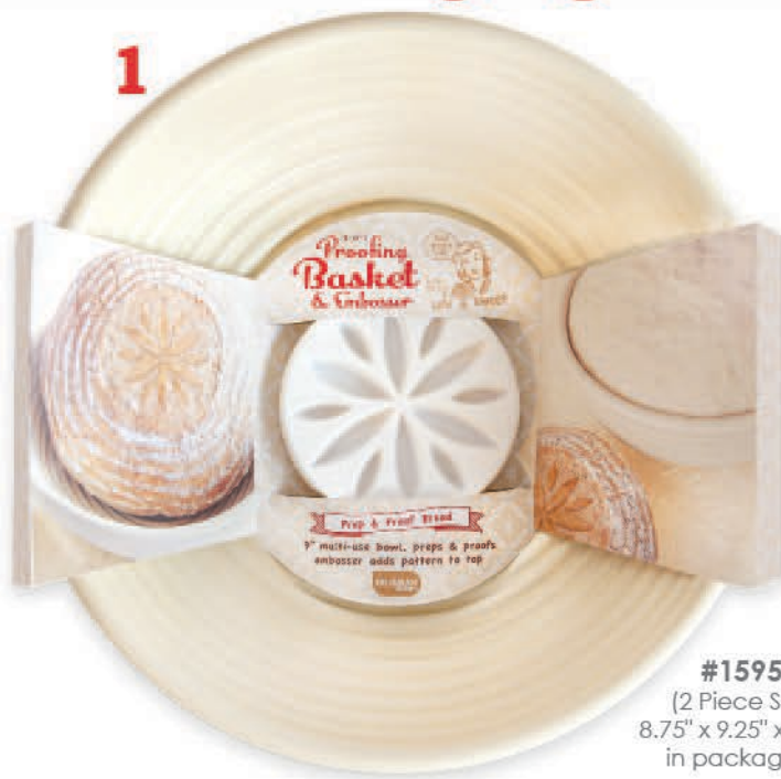
#1595 (2 Piece Set) 8.75" x 9.25" x 3.25" in packaging