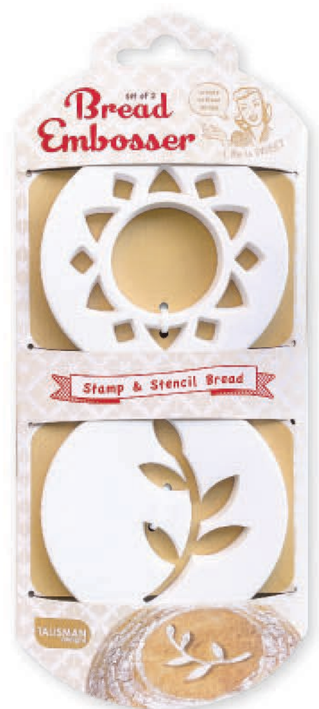
3 #1597 (2 Piece Set) 9" x 4" x .25" in packaging