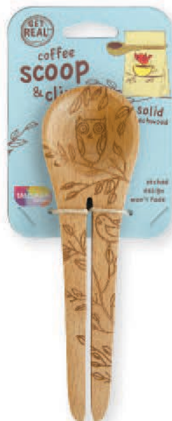
#1204 9" x 3.5" x 1" in packaging

Holds 1 Tbs. of coffee, sugar, etc. Built-in bag sealing clip.