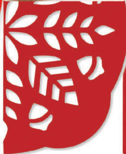
#1562 (Autumn) 9" x 4.5" x .25" in packaging