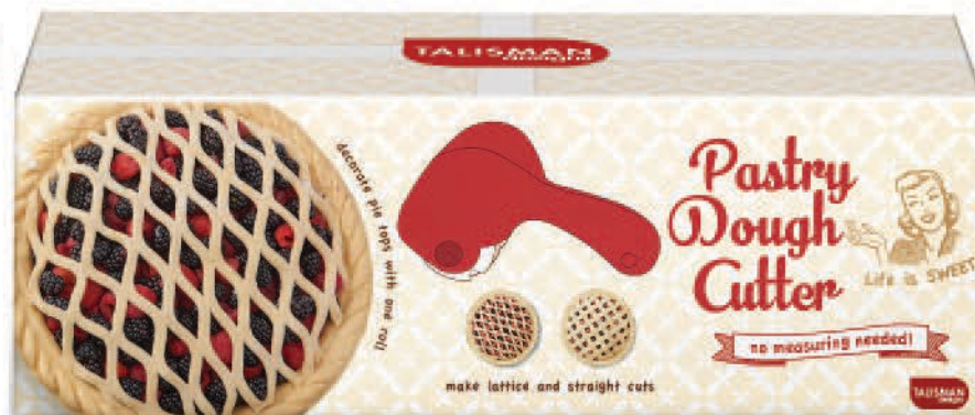
#1535 10" x 5.75" x 3.25" in packaging