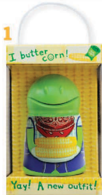
#BBG 5.75" x 3.75" x 2.75" in packaging