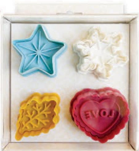
#1586 (Occasions) (4 Piece Set)