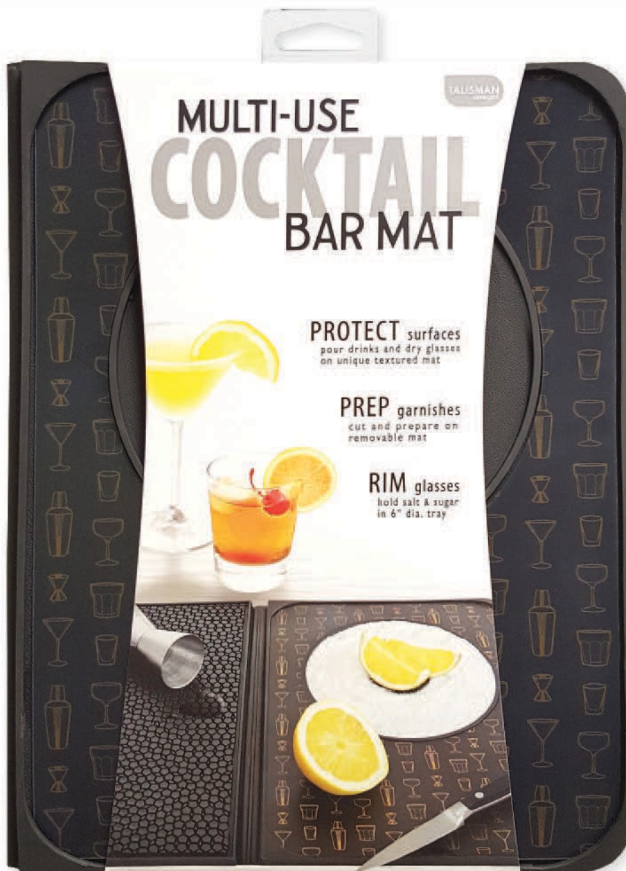
#5010 13.25" x 8.75" x .5" (Folded) in packaging