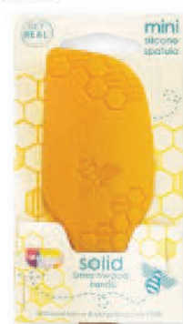
#2901 Small - 9" long 10" x 2.5" x .25" in packaging