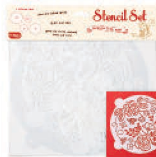
5. Item #1573 (Bee)