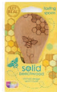
#2995 Tasting 13" x 3" x .25" in packaging