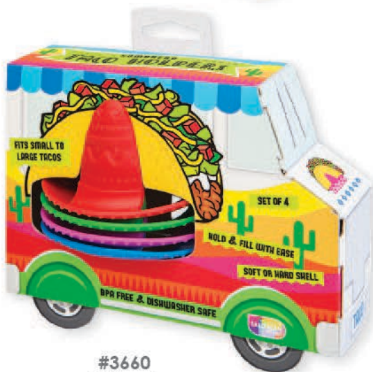
#3660 (4 Pieces) 5.75" x 1.5" x 3.25" in packaging