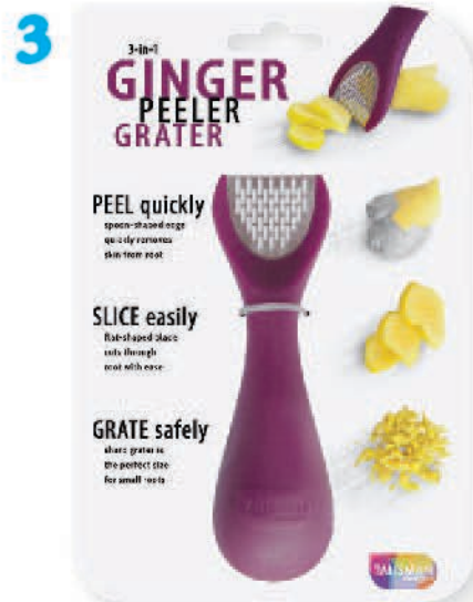
#3140 6.75" x 4.5" x 1.25" in packaging