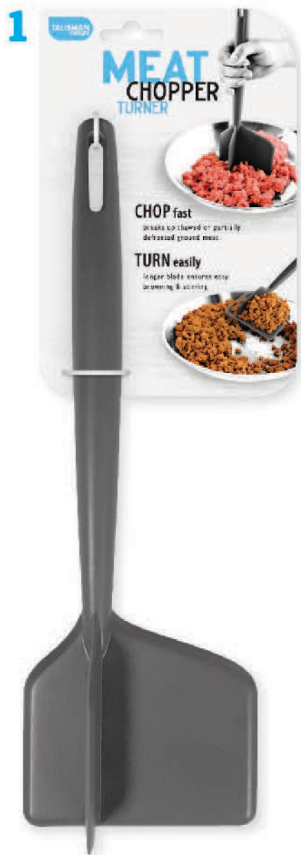
#5302 14" x 4.25" x 1.5" in packaging