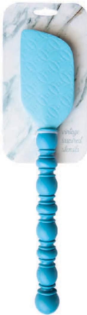
#2204 Spatula 13" x 3.5" x 1" in packaging