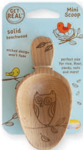
#2175 5.5" x 3" x .75" in packaging

Perfect for nuts, sugar & on charcuterie boards.