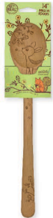
#1890 Sauce 15" x 3" x .5" in packaging