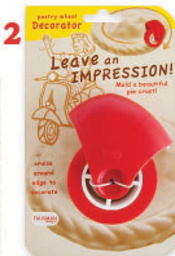
#1520 7" x 4.25" x 1.5" in packaging