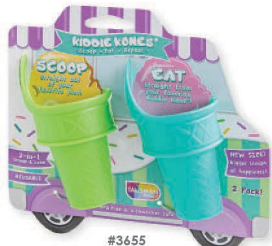
#3655 (2 Piece set) Large Kones 6.25" x 2" x 5.25" in packaging