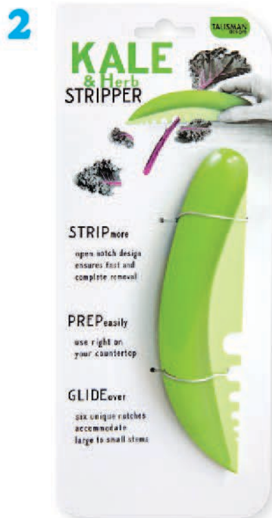
#3120 9" x 4" x .5" in packaging