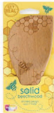
#2928 Corner 14" x 3" x .5" in packaging