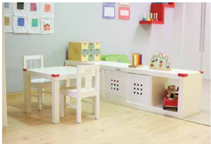
Clarity™ Accent for schools