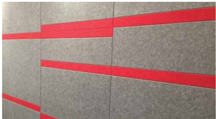
Clarity™ Accent wall