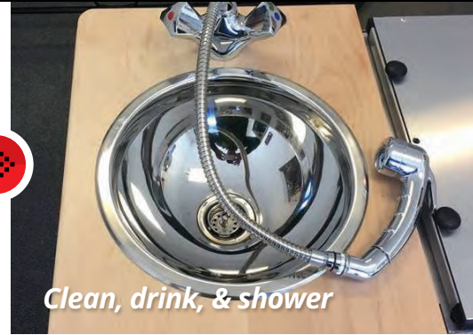
Clean, drink, & shower