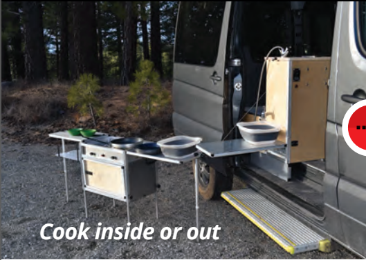
Cook inside or out

Includes TK Camp Kitchen w/ Stove - Sets up anywhere in less than 5 minutes