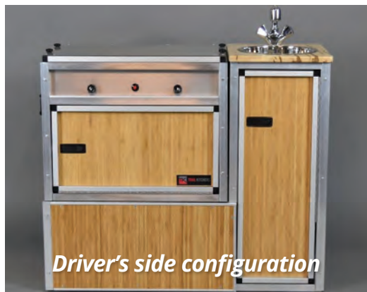
Driver's side configuration

Entire unit can be installed or removed in less than 10 minutes for increased van modularity