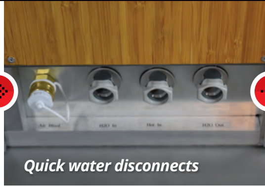
Quick water disconnects