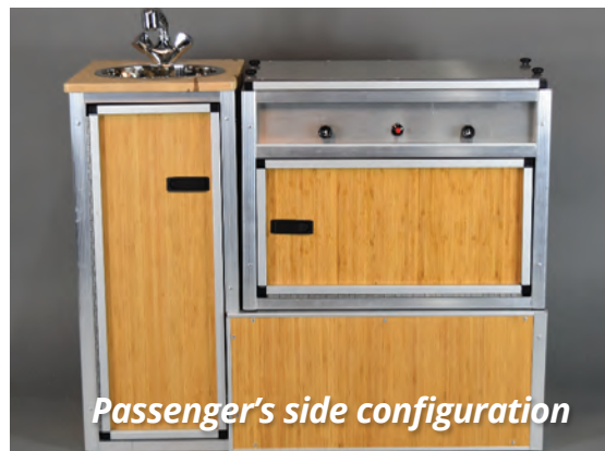
Passenger's side configuration