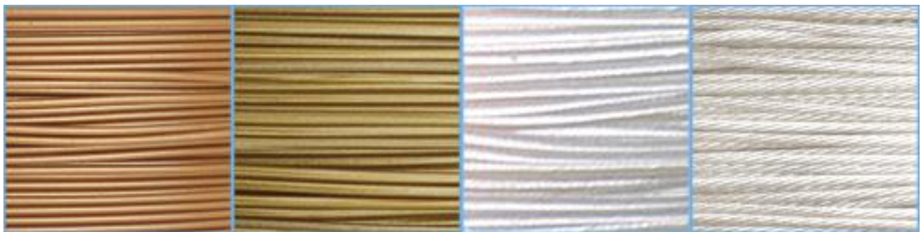
Satin Copper, Satin Gold, Satin Silver, Silver Plate