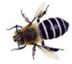
blue banded bee