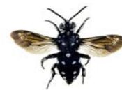
domino cuckoo bee