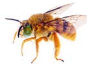
teddy bear bee