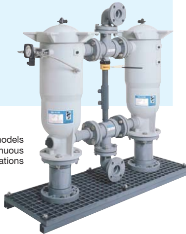
Duplex models for continuous flow applications