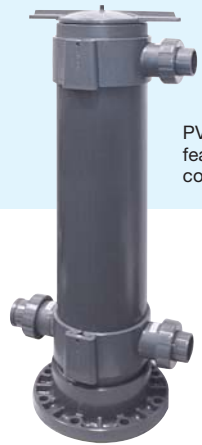
PVC/CPVC models feature true union connections