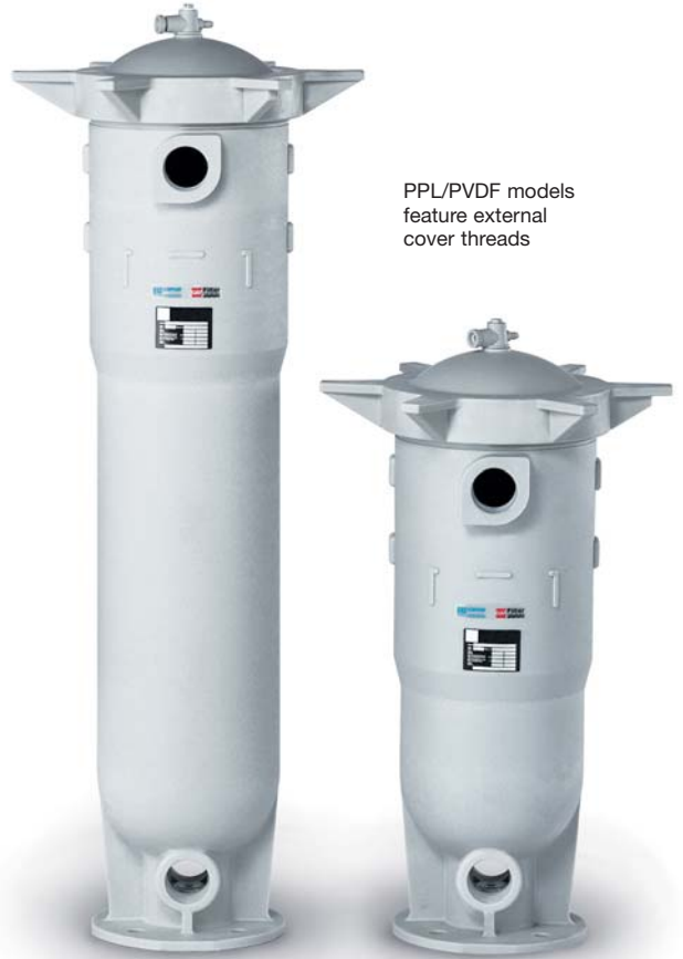
PPL/PVDF models feature external cover threads