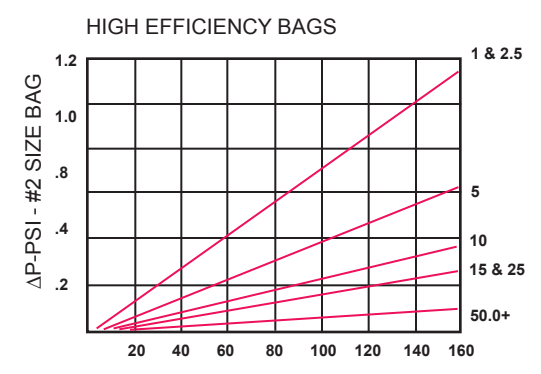
FLOW RATE OF WATER (1cps @ 77°F) GPM