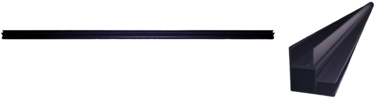
P. Long Front L - Shaped Logo Bar 45 13/16"