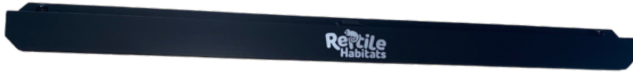
H. Long L-shaped Bar, Back x2