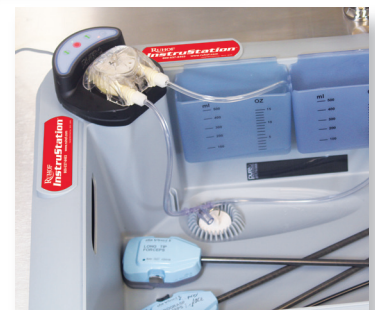
InstruFlush™ can flush robotic instruments and can be used with or without the Ruhof InstruStation™.