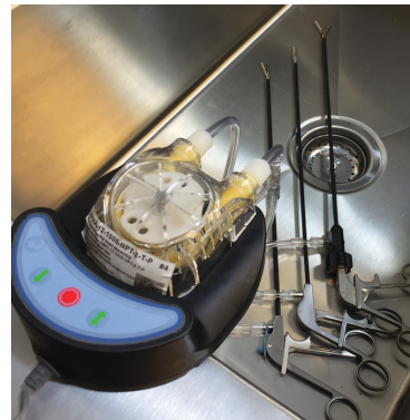
InstruFlush™ can effectively flush instrument and scope channels/lumens. The flushing system is easily adapted to existing sinks via a sink accessory rail.