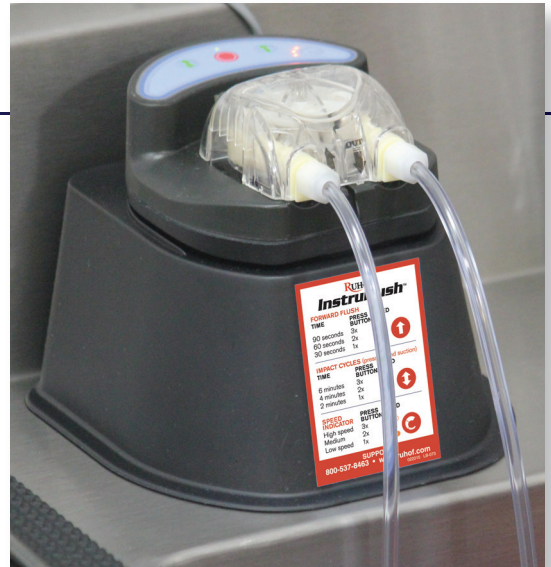
Pump on base unit can be used on countertop or wall mounted.